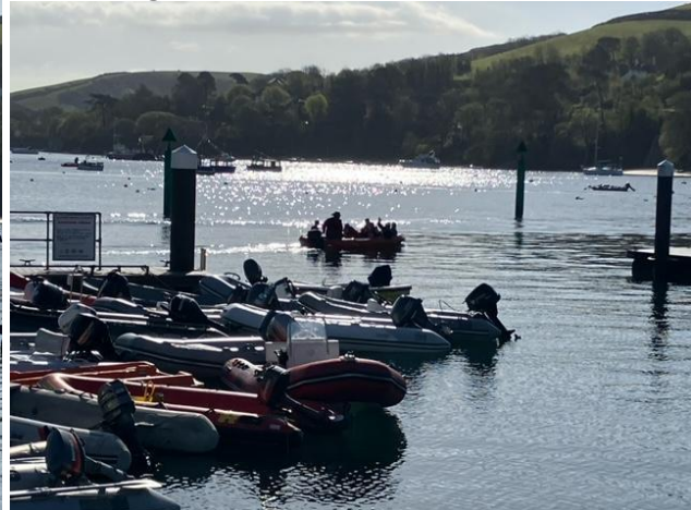
Girls going out