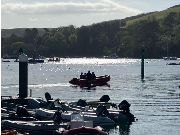
Boys going out

Our Year 5 children have had the opportunity to have access to free sailing lessons with Salcombe Dinghy Sailing. They are enjoying learning new skills and being on the water.